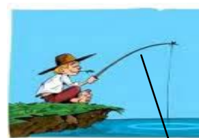
a fishing line

One fine morning, a man was fishing in a river. The sun was shining and the man (sat – was sitting – sit) on the river bank. (Fishing – Fish – Fisher) was his favourite pastime. Everything was very quiet and peaceful. The man was waiting patiently, when suddenly he stood up (quickly – slowly – sadly) and began to take in the line. There (was – were – are) a big fish but it fell back into river. At first, the man didn't know what happened. Then he (looked – look – was looking) carefully at his fishing line. It was empty. The poor man was so (disappointed – happy – satisfied) that he packed away all his things and went home.